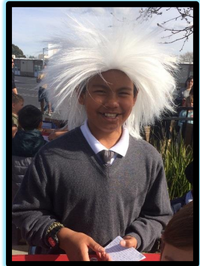
“5 th Grade Living Museum”