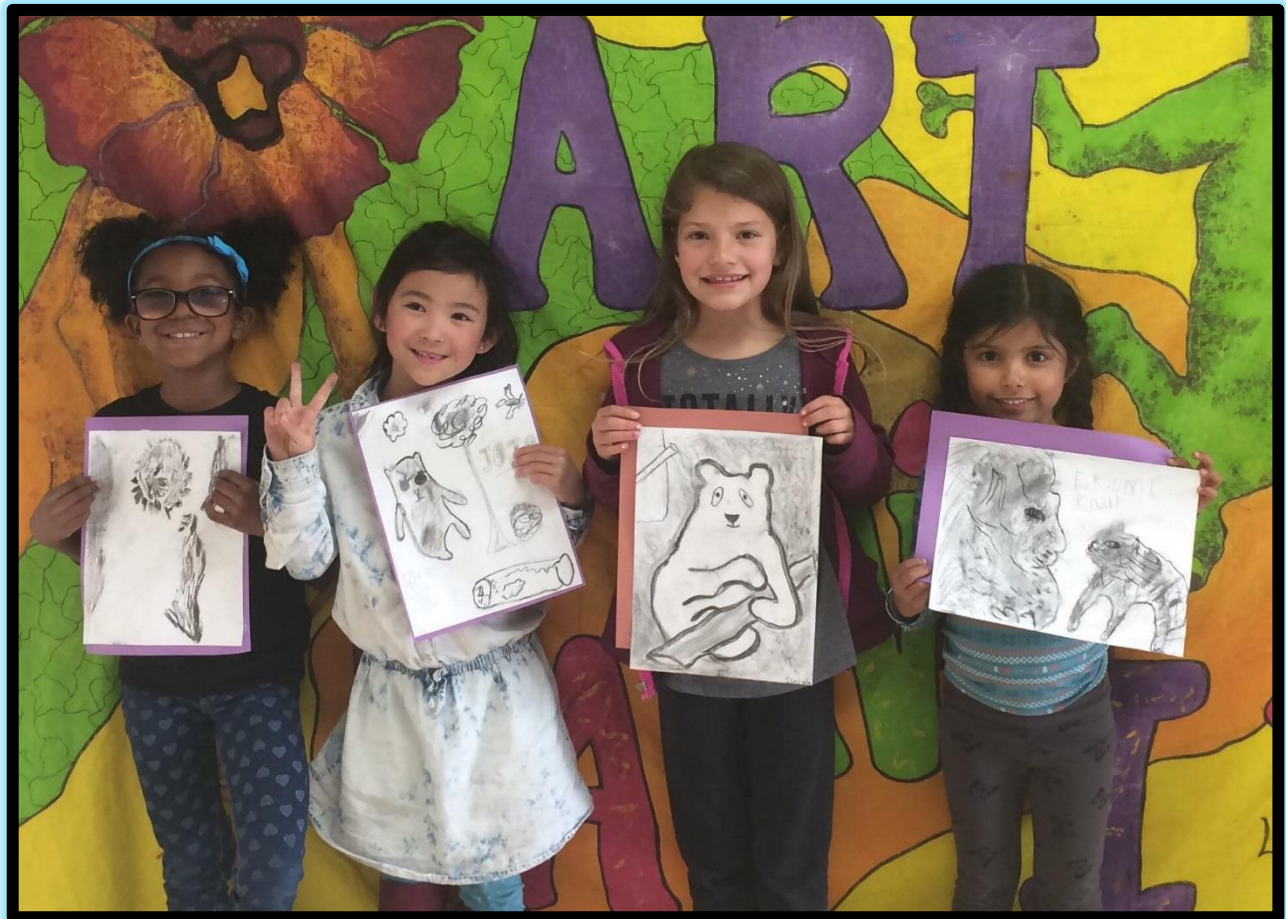
“Art Mania Masterpieces!”