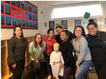
At our CPR training.

A few center reminders, the last day to turn in tuition checks will be on April 3 rd since EDCC will be closed on April 2 nd . Square payments will be made available from April 3 rd through the 5 th , we accept credit and debit cards. Lastly, EDCC will be closed on April 2 nd and we will be open for full center days for the remainder of spring break.